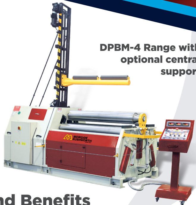
DPBM-4 Range with optional central support

The standard machines have three digital readouts to indicate the position of all the moving rolls, whilst the optional NC controller can be programmed for accuracy and volume production.