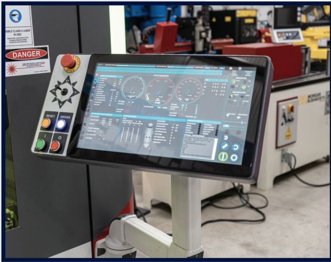
19" TFT CONTROLLER