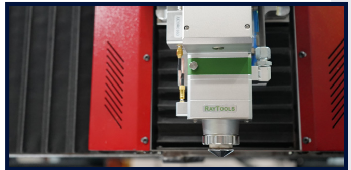
AUTO FOCUS LASER CUTTING HEAD