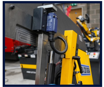
HEIGHT ADJUSTMENT SWITCH