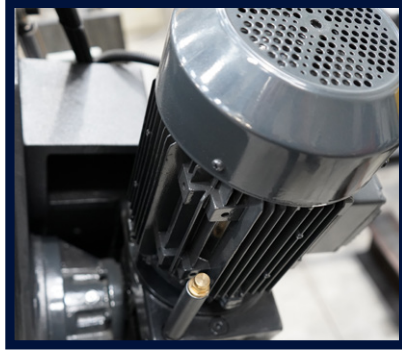
HEAVY DUTY MOTOR & GEARBOX