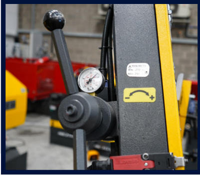
BLADE TENSION INDICATOR