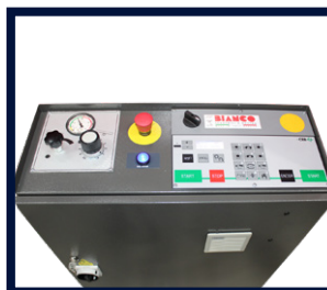
NC CONTROL PANEL