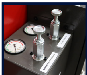
DOUBLE VICE PRESSURE REGULATOR (OPTIONAL)