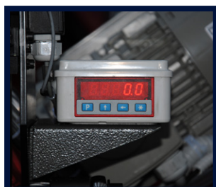
CUTTING ANGLE DISPLAY (OPTIONAL)