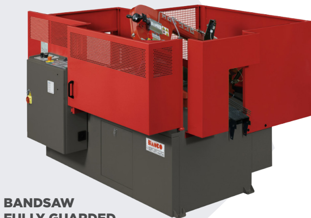
BANDSAW FULLY GUARDED