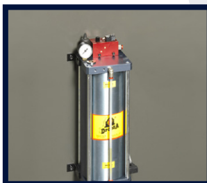
DRY COOLING DEVICE (OPTIONAL)