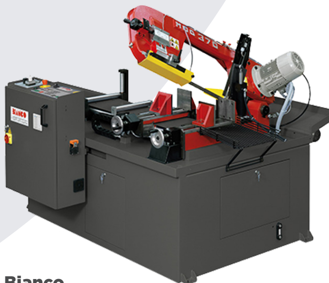
Bianco 370AFE PLC

The Bianco AFE Fully Automatic Bandsaws 415v are esteemed for their reliability, dependability and high accuracy which are hallmarks of Bianco Bandsaws. The right hand vice offers cutting stability and a short remnant length.