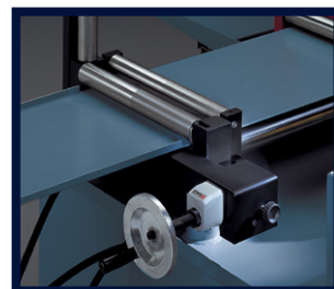
CUTTING LENGTH ADJUSTING WHEEL