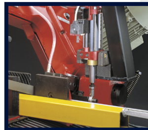
BLADE DEFLECTION CONTROL DEVICE (OPTIONAL)