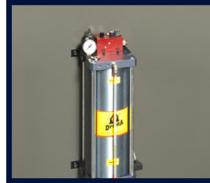
DRY COOLING DEVICE (OPTIONAL)