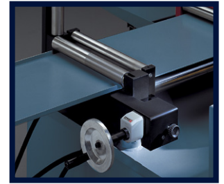
CUTTING LENGTH ADJUSTING WHEEL