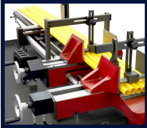
MECHANICAL BUNDLE CLAMPING DEVICE (OPTIONAL)