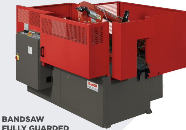
BANDSAW FULLY GUARDED