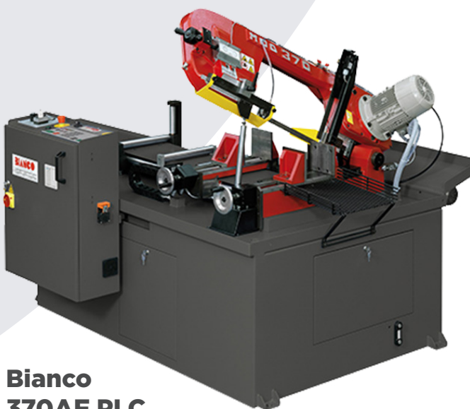
Bianco 370AF PLC

The Bianco AF Fully Automatic Bandsaws 415v are esteemed for their reliability, dependability and high accuracy which are hallmarks of Bianco Bandsaws. Equipped with a front hydraulic ram for increased bow support. The right hand vice offers cutting stability and a short remnant length.