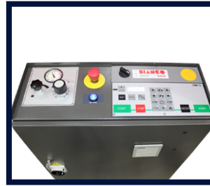
NC CONTROL PANEL