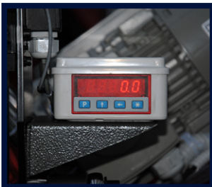
CUTTING ANGLE DISPLAY (OPTIONAL)