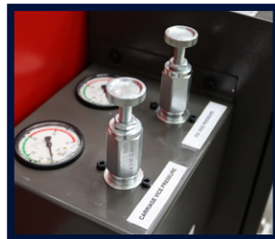
DOUBLE VICE PRESSURE REGULATOR (OPTIONAL)