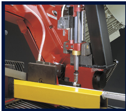
BLADE DEFLECTION CONTROL DEVICE (OPTIONAL)