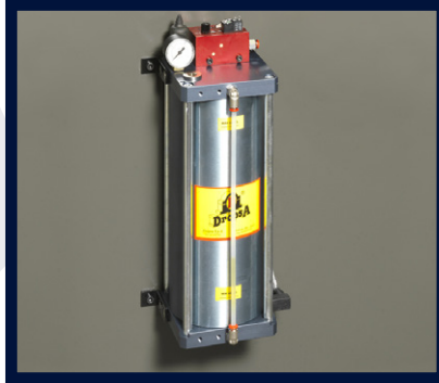
DRY COOLING DEVICE (OPTIONAL)