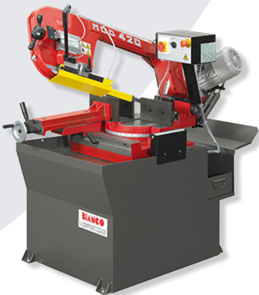
Bianco 420 MR

All MR models are fitted with a sliding vice, and have double quick mitring head capability allowing fixed roller track systems to be installed with the ability to cut at any angle up to 60 degrees right and 45 degrees left. Two speed motors allow for both the cutting of mild steel and stainless steel.