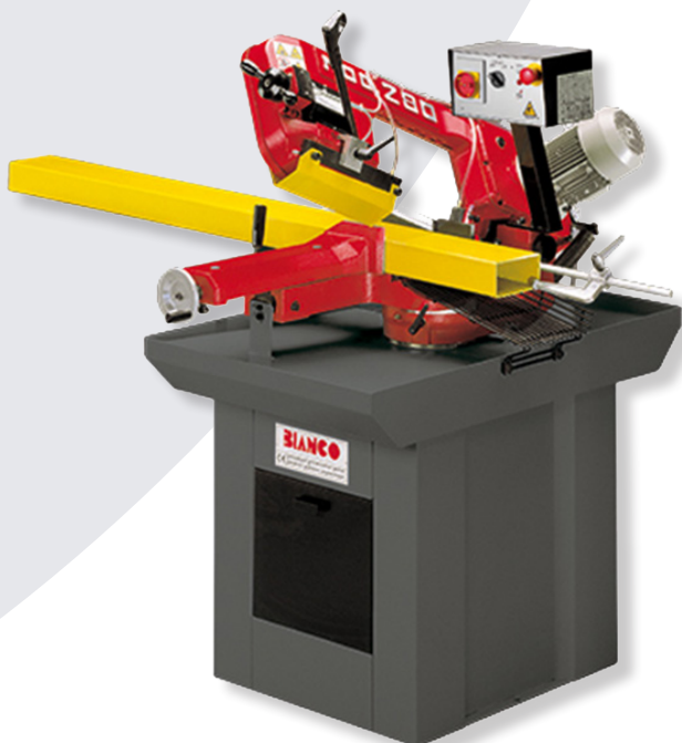
Bianco 280 M

The 280 M has quick mitring head capability allowing fixed roller track systems to be installed with the ability to cut at any angle up to 60 degrees. Two speed motors allow for both the cutting of mild steel and stainless steel.