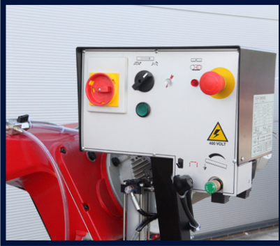
GRAVITY DOWNFEED (OPTIONAL)