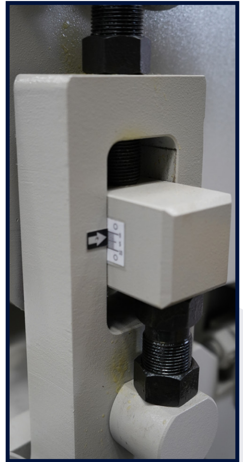
CLAMPING BEAM ADJUSTMENT