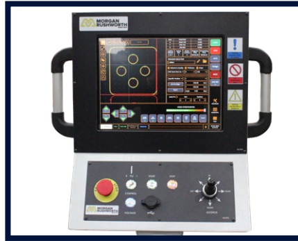
ECP PLASMA LYNCA-CNC CONTROLLER