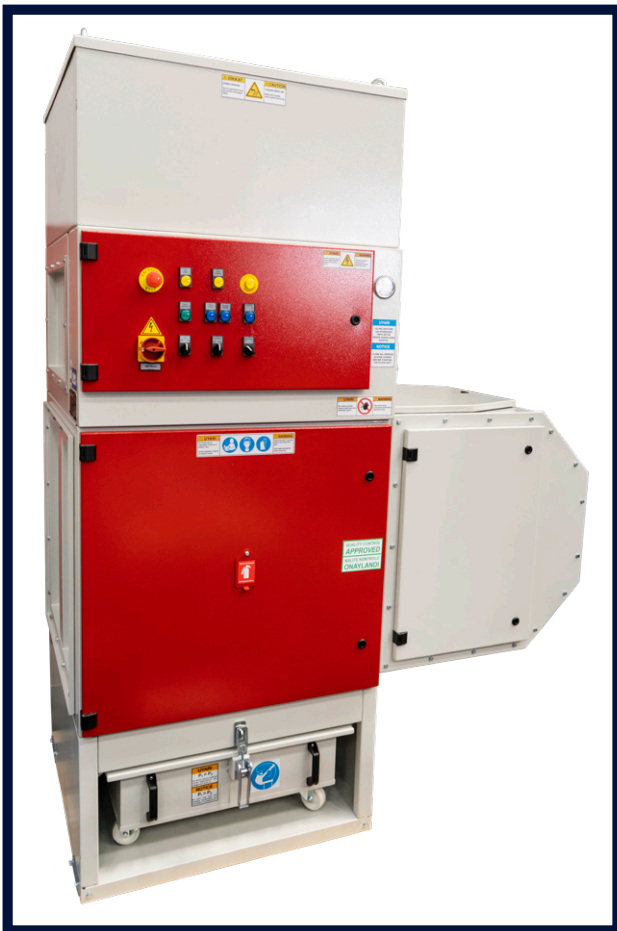
EXTRACTION / FILTRATION SYSTEM (OPTIONAL)

The optional extraction and filtration system can be used to extract smoke and fumes from the plasma table during cutting. This is especially important for cutting aluminium, where the dust and fumes can be explosive if not handled correctly.