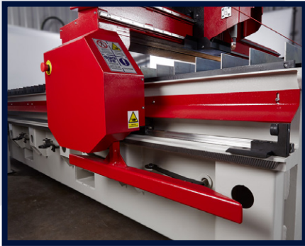
ECP PLASMA MECHANICAL EXTRACTION ZONE

The ECP has a very heavy-duty table and gantry with a compact bed size of 3m x 1.5m. It has a solid welded structure with the rack and pinion having a linear guidance system providing excellent accuracy and alignment. The rails are of a modern design which includes protection and distance from the cutting process ensuring longevity and accuracy.