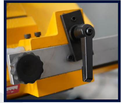
CARBIDE BLADE GUIDES