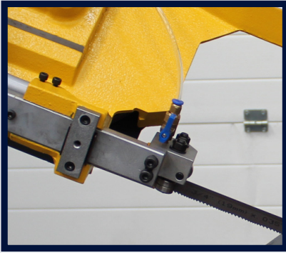
FLOOD COOLANT SYSTEM