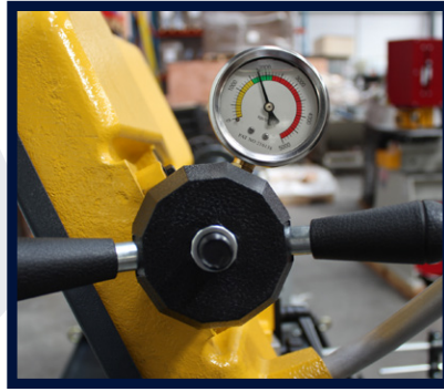
BLADE TENSION INDICATOR