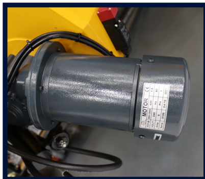
INVERTER MOTOR (240V)