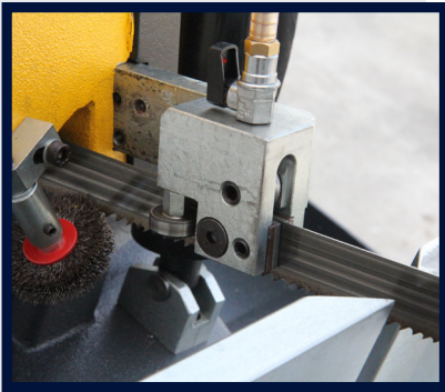
FLOOD COOLANT SYSTEM