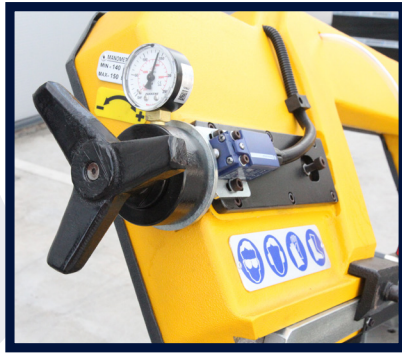
BLADE TENSION INDICATOR