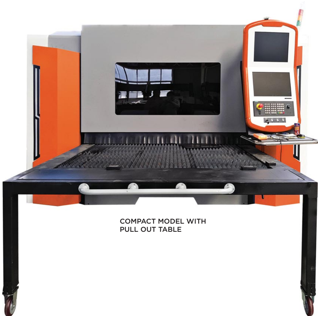
COMPACT MODEL WITH PULL OUT TABLE