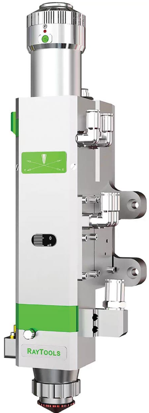
RAYTOOLS LASER CUTTING HEAD