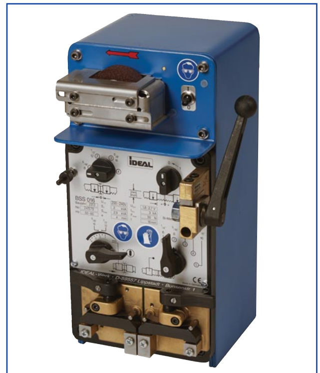
OPTIONAL BLADE WELDER