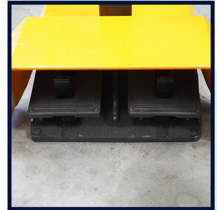
FOOT PEDAL CONTROLS