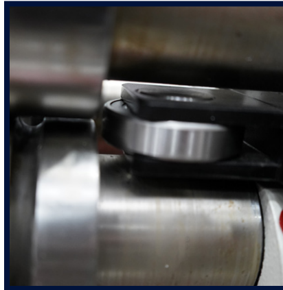
CONE ROLLING WHEEL