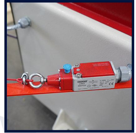
TRIPWIRE SAFETY SYSTEM