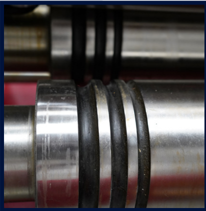
ROUND BAR GROOVES