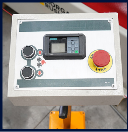
POWERED SIDE ROLL CONTROLLER WITH DIGITAL READOUT (OPTIONAL)