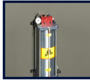
DRY COOLING DEVICE (OPTIONAL)