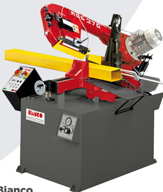
Bianco 370 SAE (Low Controller Position)

The Bianco SAE Semi Automatic Single Mitre Bandsaws 415v are esteemed for their reliability, dependability and high accuracy which are hallmarks of Bianco Bandsaws.