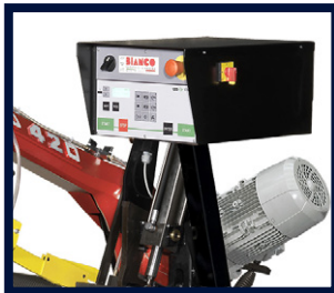
HIGH CONTROL PANEL (OPTIONAL)