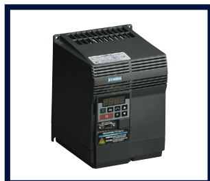
FREQUENCY CONVERTER (OPTIONAL WITH HIGH PANEL ONLY)