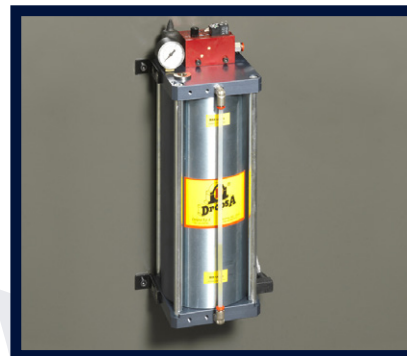
DRY COOLING DEVICE (OPTIONAL)