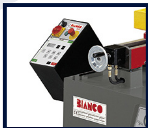
LOW CONTROL PANEL (OPTIONAL)