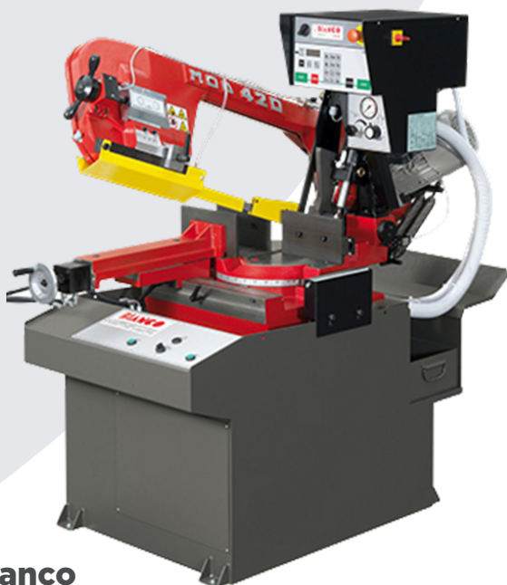
Bianco 420 SA R (High Controller Position)

The Bianco SA R Semi Automatic Double Mitre Bandsaws 415v are esteemed for their reliability, dependability and high accuracy which are hallmarks of Bianco Bandsaws.