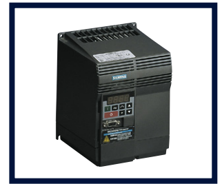
FREQUENCY CONVERTER (OPTIONAL WITH HIGH PANEL ONLY)