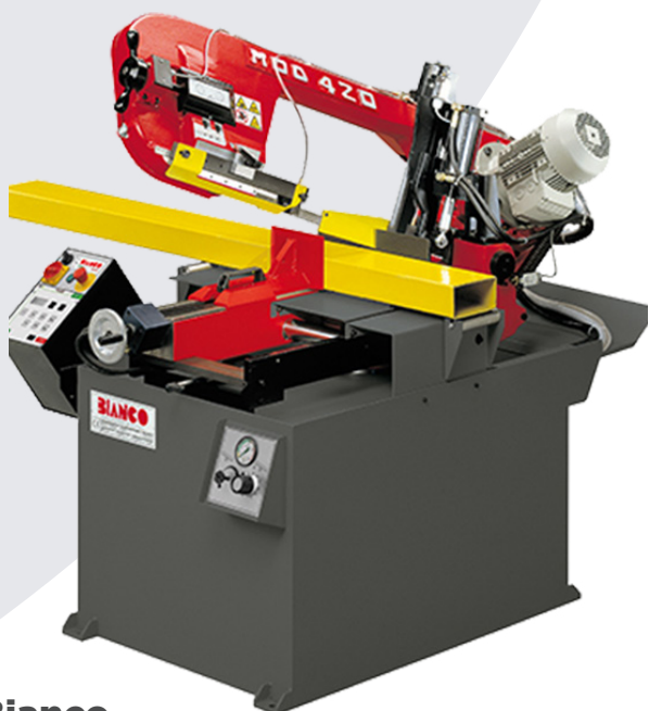
Bianco 420 SA DS MS (Low Controller Position)

The Bianco SA DS MS Semi Automatic Single Mitre Bandsaws 415v are esteemed for their reliability, dependability and high accuracy which are hallmarks of Bianco Bandsaws.