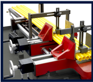
MECHANICAL BUNDLE CLAMPING DEVICE (OPTIONAL)