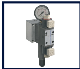
ADJUSTABLE VICE PRESSURE (OPTIONAL)