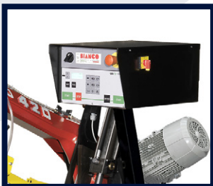
HIGH CONTROL PANEL (OPTIONAL)