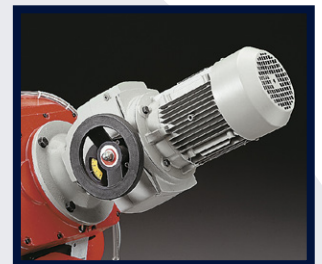
VARIABLE BLADE SPEED (10-100 M/MIN) (OPTIONAL WITH LOW PANEL ONLY)