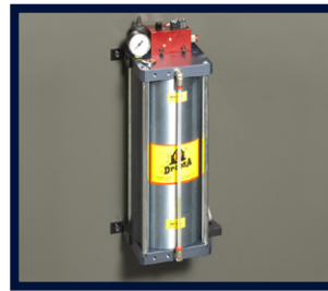
DRY COOLING DEVICE (OPTIONAL)