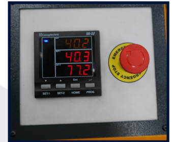
FOOT PEDAL CONTROLLER