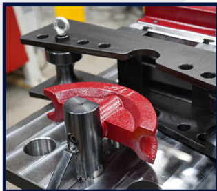
TUBE / PIPE BENDING