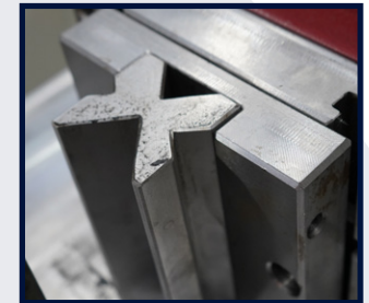
MULTI V, V AND RADIUS PUNCHES