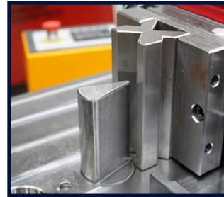
30° BOLT PUNCH