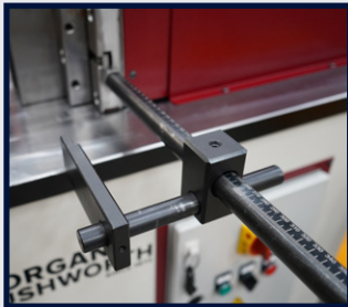
MEASURED RULE STOP