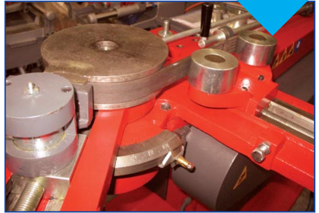
FLAT BAR BENDING