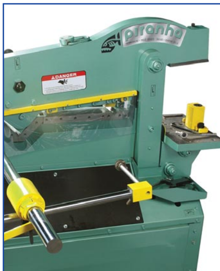
OPTIONAL BACKGAUGE ATTACHMENT