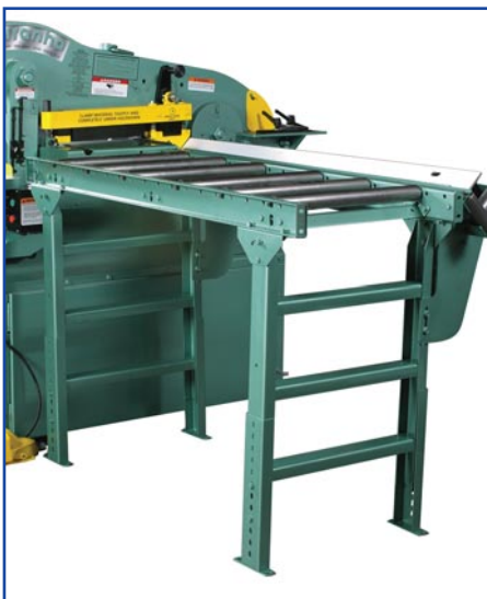
OPTIONAL ROLLER FEED TABLES