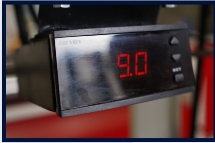
DIGITAL READ-OUT (OPTIONAL)