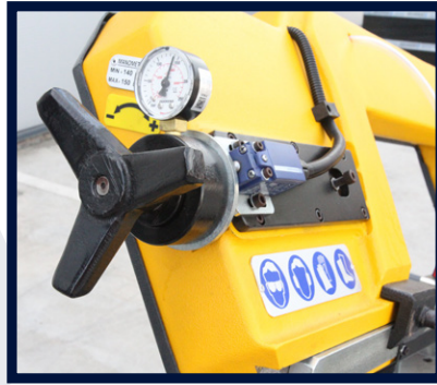
BLADE TENSION INDICATOR