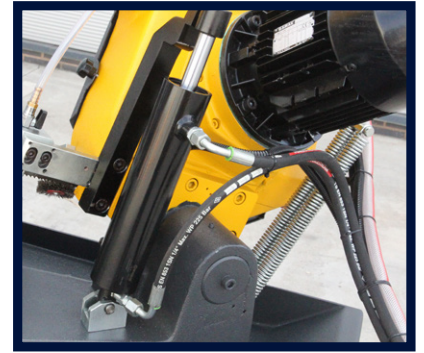
BLADE AUTO STOP