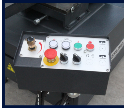
CONTROL PANEL (230DG)