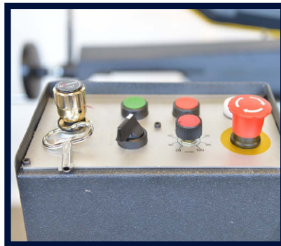
CONTROL PANEL (270DG)