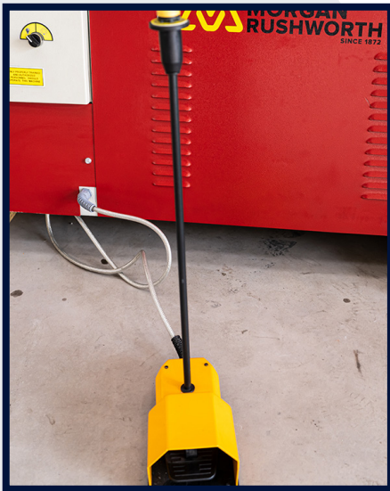
FOOT PEDAL CONTROLLER