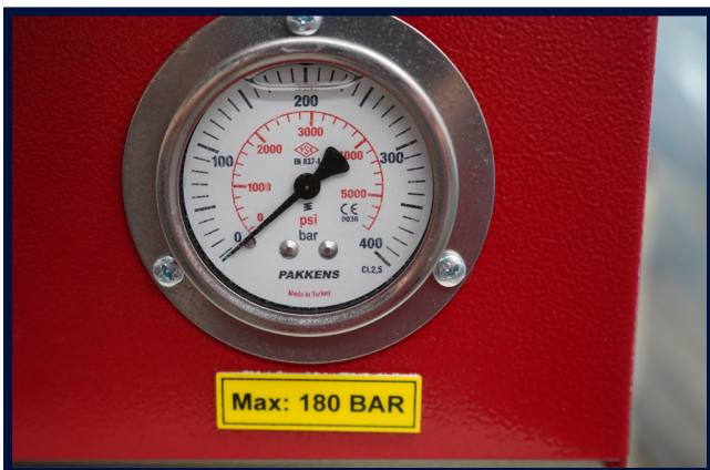
HYDRAULIC PRESSURE GAUGE

Capacities are given for 260 N/mm 2 plate yielding strength | * Specialist tooling recommended | ** Specialist tooling required | *** Only with special Beam Bending Attachment