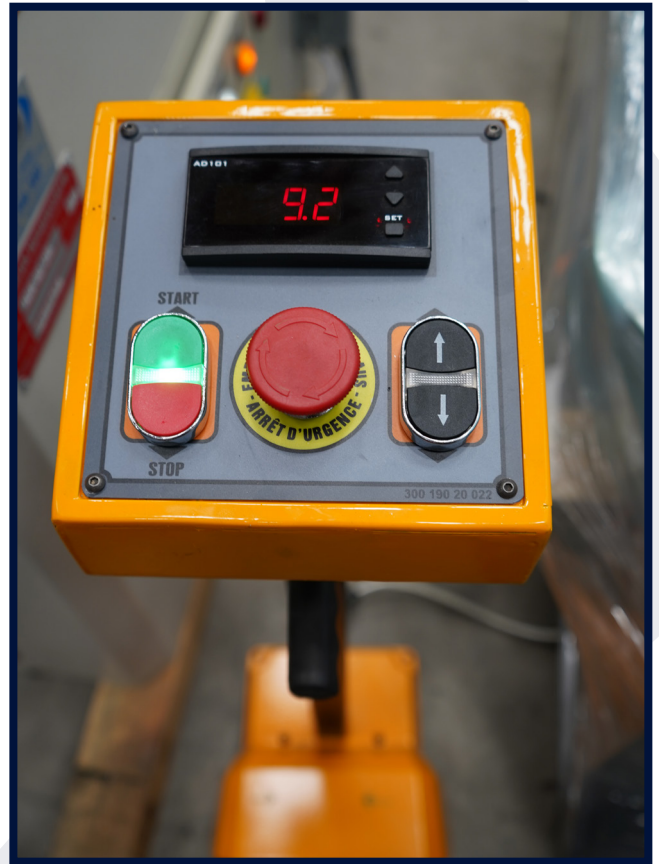
DIGITAL READOUT OF TOP ROLL POSITION