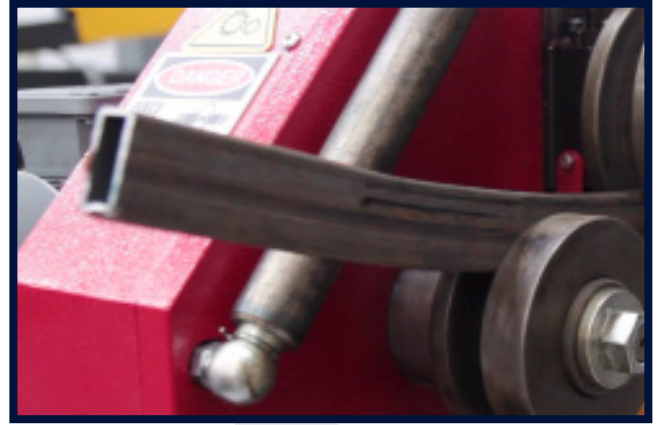
BENDING BOX SECTION