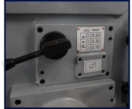
POWER FEED SPEEDS