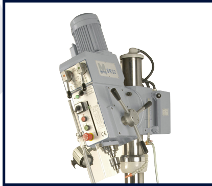
WIND UP AND TILTING HEAD (SR32 &SR32AE)