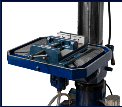
POWERED RISE AND FALL TABLE (SR50VAE)