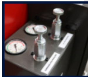
DOUBLE VICE PRESSURE REGULATOR (OPTIONAL)