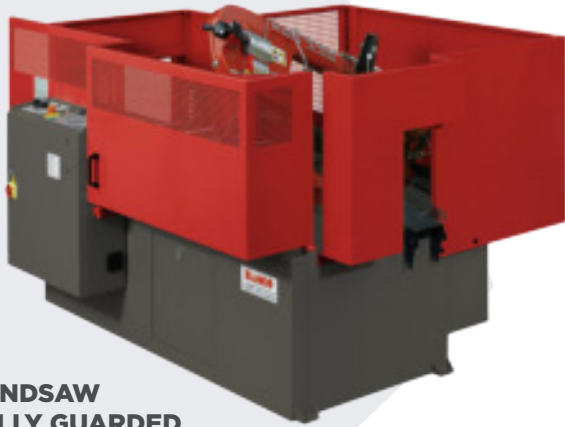
BANDSAW FULLY GUARDED