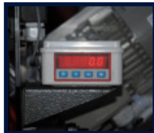
CUTTING ANGLE DISPLAY (OPTIONAL)