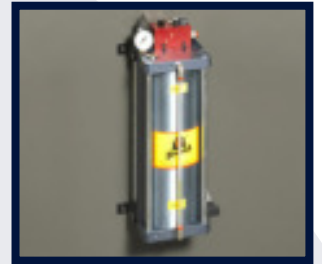
DRY COOLING DEVICE (OPTIONAL)