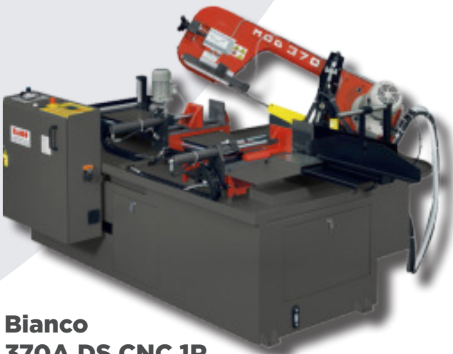
Bianco 370A DS CNC 1R

All Bianco machines are manufactured in Italy to high quality standards with accuracy and longevity as prime considerations.