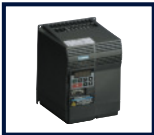
FREQUENCY CONVERTER (OPTIONAL)