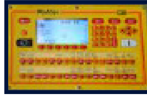
NC CONTROL PANEL