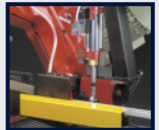
BLADE DEFLECTION CONTROL DEVICE (OPTIONAL)