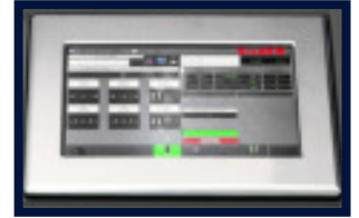
TOUCH SCREEN CONTROL PANEL (OPTIONAL)