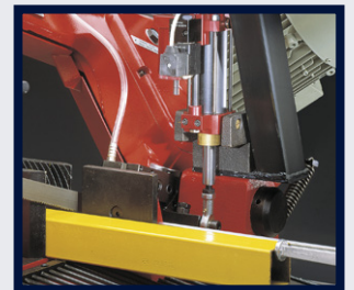
BLADE DEFLECTION CONTROL DEVICE (OPTIONAL)