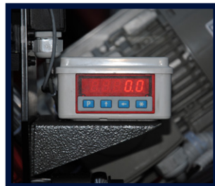
CUTTING ANGLE DISPLAY (OPTIONAL)