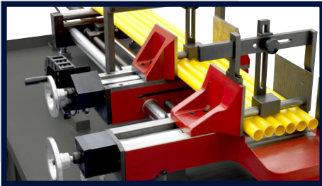
MECHANICAL BUNDLE CLAMPING DEVICE (OPTIONAL)