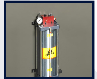
DRY COOLING DEVICE (OPTIONAL)