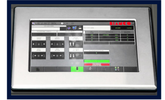
TOUCH SCREEN CONTROL PANEL (OPTIONAL)