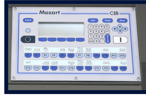
CNC CONTROL PANEL