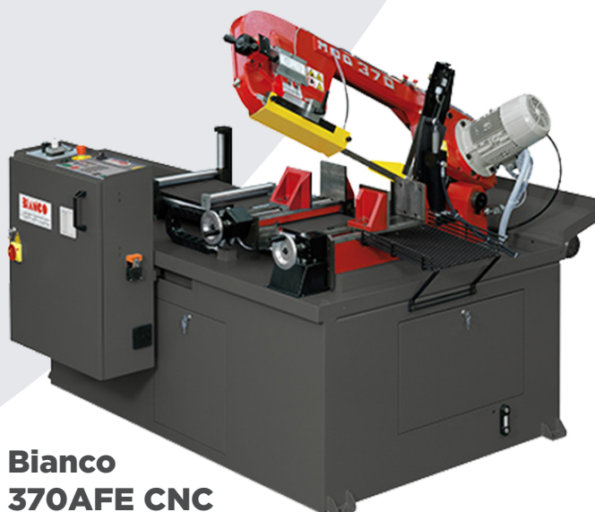
Bianco 370AFE CNC

The Bianco AFE CNC Bandsaws 415v are esteemed for their reliability, dependability and high accuracy which are hallmarks of Bianco Bandsaws. The right hand vice offers cutting stability and a short remnant length.