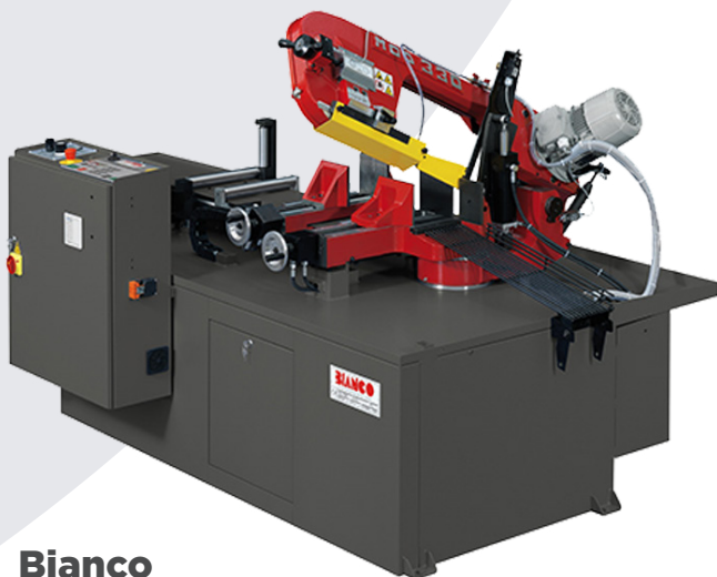
Bianco 330AE CNC

The Bianco AE CNC Single Mitre Bandsaws 415v are esteemed for their reliability, dependability and high accuracy which are hallmarks of Bianco Bandsaws.