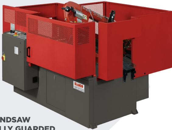
BANDSAW FULLY GUARDED