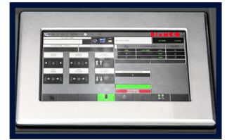
TOUCH SCREEN CONTROL PANEL (OPTIONAL)